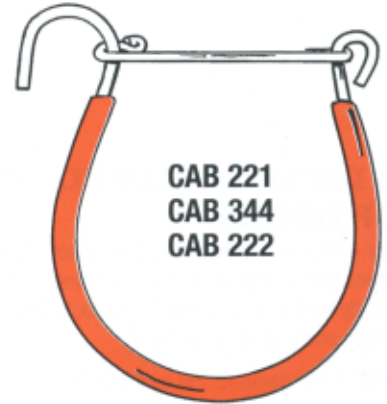
CAB 221 CAB 344 CAB 222