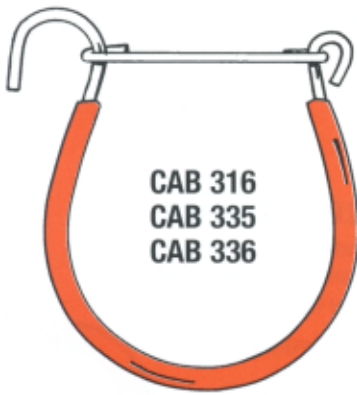
CAB 316 CAB 335 CAB 336

These are strong hangers made for supporting all types of cables, pipe and tubing from roof bolt plates, spads, or other structure. All carrying surfaces receive a heavy coating of high dielectric grade plastisol for maximum insulation and abrasion resistance. These hangers are made from .187 high carbon spring steel wire for maximum strength and carrying capacity. They feature a locking crossbar to retain cables in the hanger and a large 7/8" diameter top loop for easy installation.