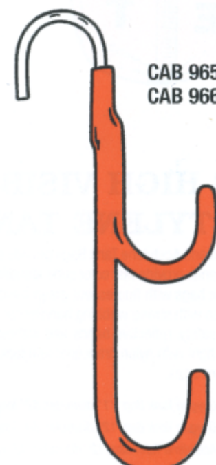
CAB 965 CAB 966