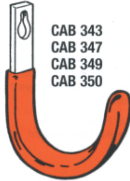
CAB 343 CAB 347 CAB 349 CAB 350